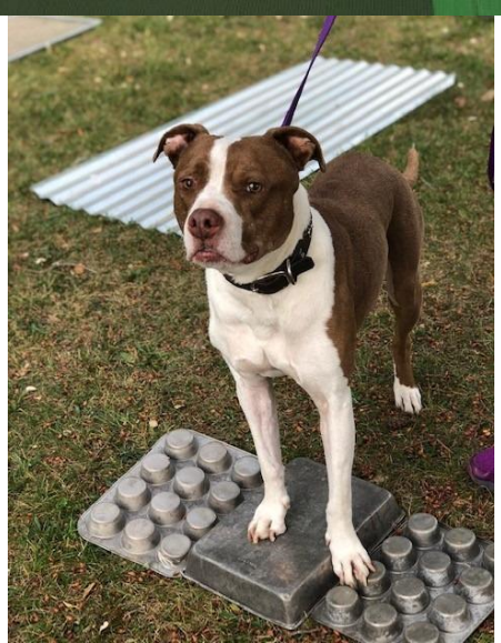
Page 2 of 4