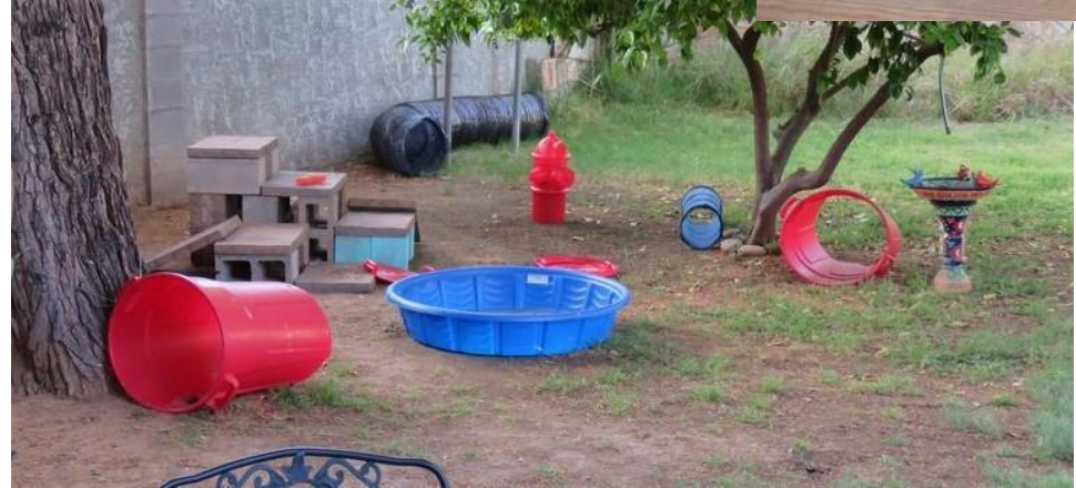
Page 4 of 4