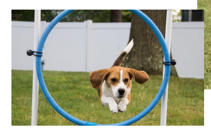
Page 3 of 4

Using a hula hoop or flexible tubing to make a jump is also fun. These examples show a PVC base and sides. If making this item be sure that the feet of the stand are long enough to balance the weight.